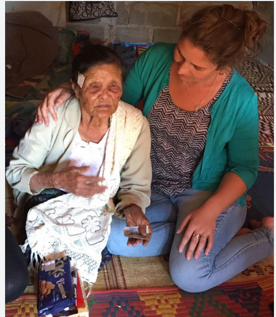
Pictured Above: A Burmese grandmother giving a blessing at the Koung Jor Shan Refugee Camp.

More information can be found at www.thebranchfoundation.org